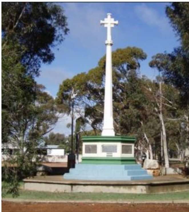
Moora War Memorial